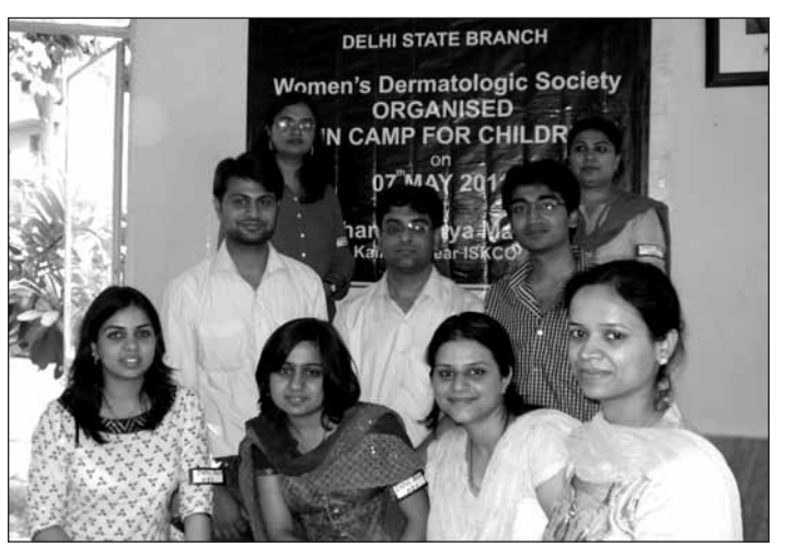
Members of IADVL Delhi pictured with male and senior residents of IADVL Delhi who joined hands in this endeavor.