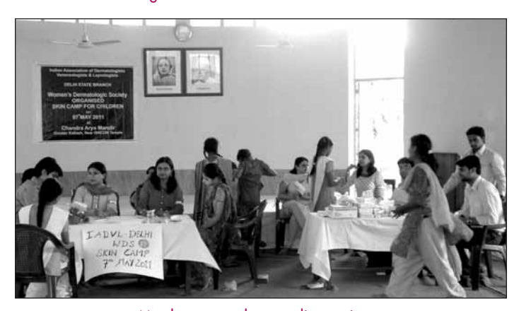
Members at work counseling patients.