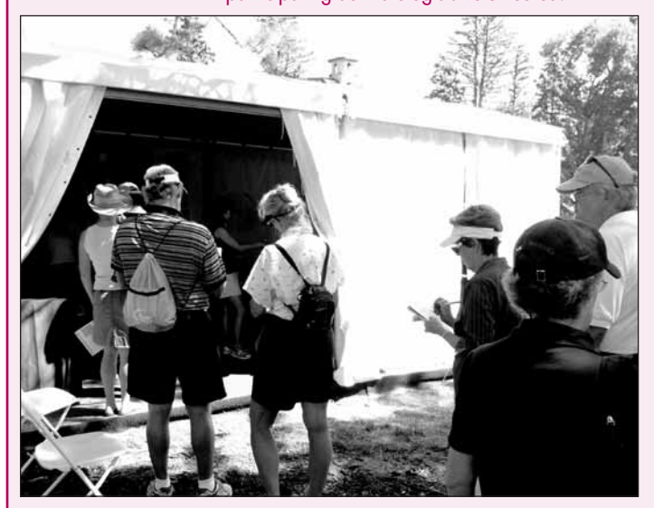
Constant crowds flocked to the WDS Play Safe in the Sun booth at the US Women's Open in Colorado Springs, where WDS dermatologists performed a record total of 428 skin cancer screenings.