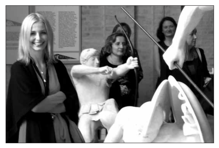
Attendees enjoy a tour of the Glyptothek collection of ancient Greek statues at the Glyptothek and Antikensammlung (Museum of Antiquities).