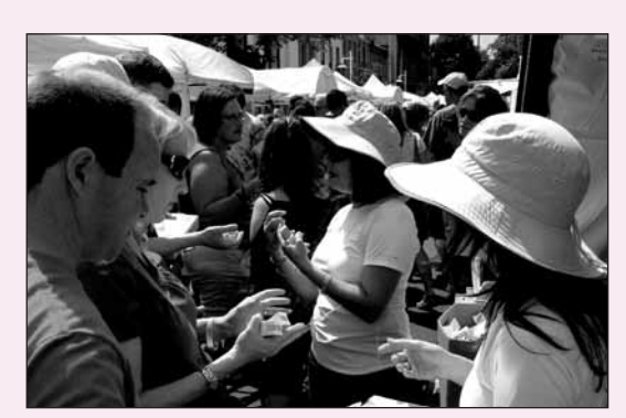
Throughout the busy weekend in Philadelphia, the fantastic WDS volunteer team reached out to many visitors to the Manayunk Arts Festival.