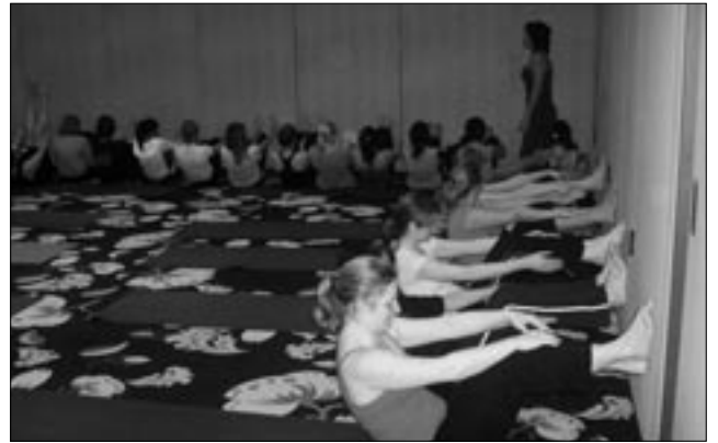
Who could forget the Pilates drill sergeant!?