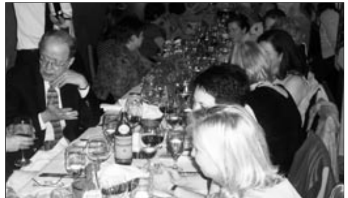
Who can forget how many wine glasses filled that long table?