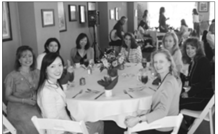
Guests enjoying the beautiful weather and great networking luncheon hosted by the Women Dermatologic Surgeons Committee during the ACMMSO conference in Scottsdale, Arizona.