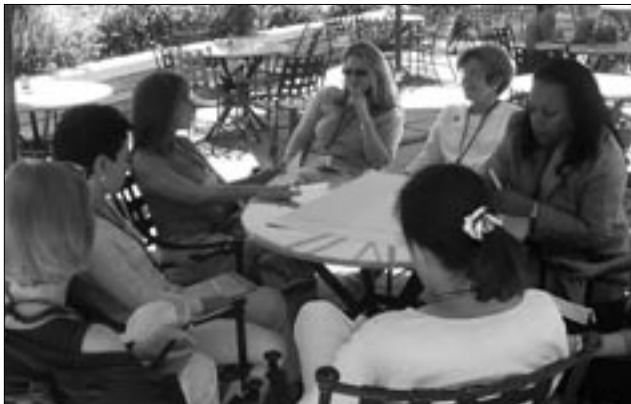
During the WDS Leadership Retreat, groups discussed leadership qualities and building future leaders within WDS.