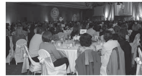
WDS Annual Meeting Luncheon held in February 2007 in Washington, DC

A new non-profit organization dedicated to supporting the objective and activities of WDS. Donations to the foundation are 100% tax deductible as a charitable donation - 501 (c) (3) status (Tax ID# 20-0084052).