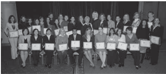
WDS 2007 Mentorship Grant Award Recipients